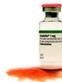
Yondelis 1 Mg Powder