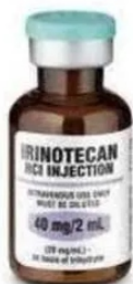
Irinotecan 40mg/2ml Injection