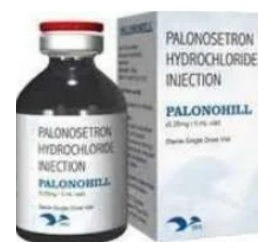
Palonosetron HCL Injections