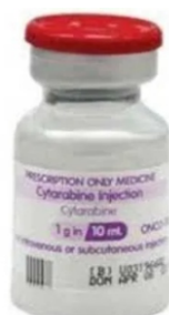
Cytosine Arabinoside Injection