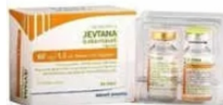
Jevtana 60 mg Injection