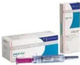
PEG Grafeel Injection