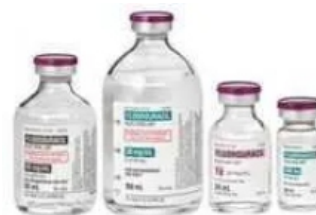
5 Fluorouracil Injection