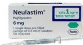
Neulastim 6mg Injection