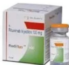
Reditux 100 mg / 500 mg Injection