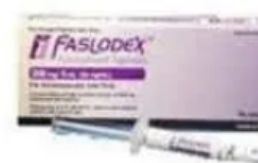
Faslodex 250 mg Injection