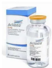
Aclasta 5mg Injection