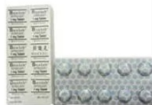
Baraclude 1 mg Tablets