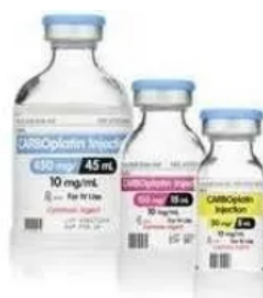
Carboplatin 450 Mg/45 ML Injection