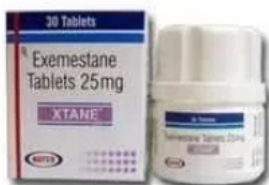
Exemestane 25mg Tablets