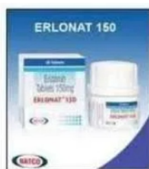
Erlonat 150 Mg Tablet